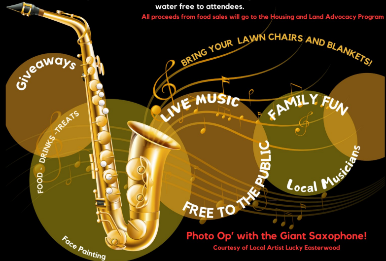
Photo Op' with the Giant Saxophone! Courtesy of Local Artist Lucky Easterwood

All proceeds from food sales will go to the Housing and Land Advocacy Program