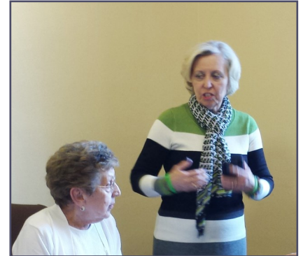
Above: Senator Pat Petty takes a moment to share her views on getting Kansas back on track as it regards to its budget shortfall.