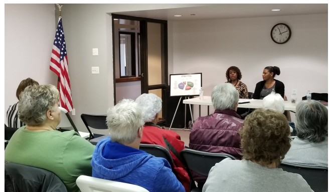
Bonner Springs Senior Center - March 27, 2018

The Wyandotte/Leavenworth Area Agency on Aging held two public hearings on March 27th and April 19th. Public Hearings are designed to give the public an opportunity to learn about programs and/or provide feedback regarding senior services in Wyandotte and Leavenworth Counties. If you were unable to attend one of the scheduled meetings and would like to provide feedback, please contact the Area Agency on Aging at 913-573-8531 or by sending an email to 60Plus@wycokck.org .