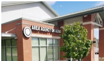
Wyandotte/Leavenworth Area Agency on Aging